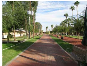
Grand Canyon University