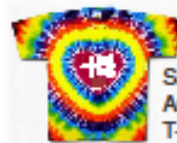
Sample of Anniversary T-shirt